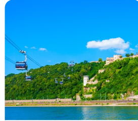
Koblenz Guided tour Ehrenbreitstein Fortress