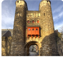
Maastricht Guided Tour of the North Caves