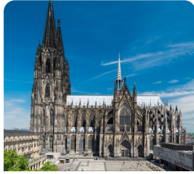
Cologne Cologne Cathedral and Treasury