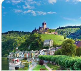
Cochem Bundesbank Bunker Museum & Burg Eltz