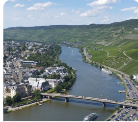
Rhine River Cruise Rüdesheim to Boppard