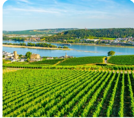
Rüdesheim Cable Car Ride to Niederwald Monument