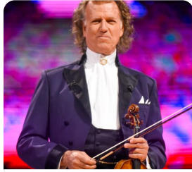
André Rieu Concert A Night to Remember!

These are just a few of the very special hand selected inclusions that will really make your touring experience exceptional and unique, and don't forget, with Albatross they are always included.