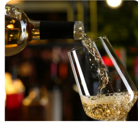
Moselle Wine Tasting Bernkastel-Kues