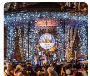
Zagreb Christmas Markets