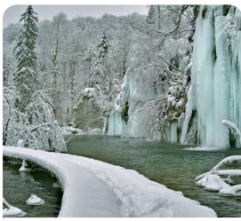
Plitvice Majestic Waterfalls