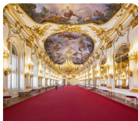
Schönbrunn Palace Guided Tour

These are just a few of the very special hand selected experiences that will really make your touring experience exceptional and unique, and don't forget, with Albatross they are always included.