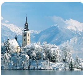
Lake Bled Bled Castle, Pletna Boat Cruise & Horse and Carriage ride