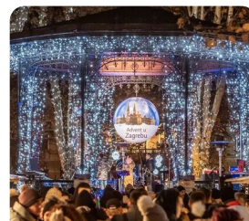
Zagreb Christmas Markets