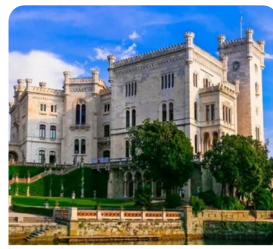
Castello di Miramare Nature & History