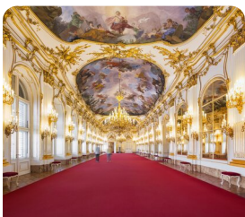
Schönbrunn Palace Guided Tour

These are just a few of the very special hand selected experiences that will really make your touring experience exceptional and unique, and don't forget, with Albatross they are always included.