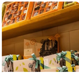
Chocolate Tasting Opatija