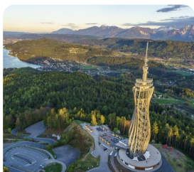
Pyramidenkogel Observation Tower