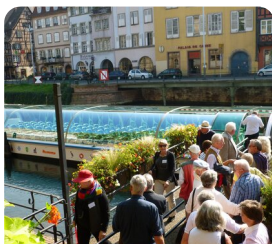
Strasbourg River Cruise