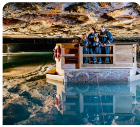
Salt Mines Berchtesgaden