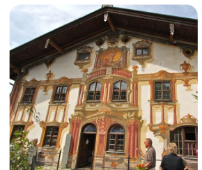
Oberammergau Traditional Bavarian Village