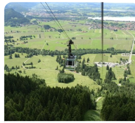
Tegelberg Cable Car Ride