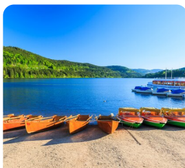
Lake Titisee Lunch and Lake Cruise