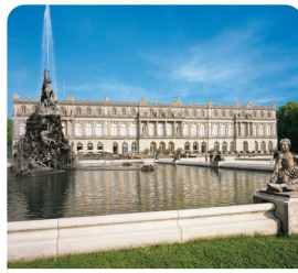
Herrenchiemsee Palace Guided Visit