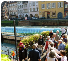
Strasbourg River Cruise