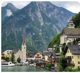
St Wolfgangsee In the Salzkammergut