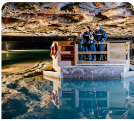
Salt Mines Berchtesgaden