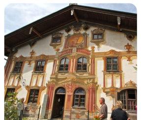
Oberammergau Traditional Bavarian Village