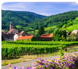
Alsace Wine Road Wine Tasting

These are just a few of the very special hand selected experiences that will really make your touring experience exceptional and unique, and don't forget, with Albatross they are always included.