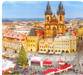
Prague Sightseeing Tour & Christmas Markets