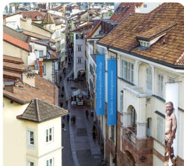
Bolzano Capital of Alto Adige region