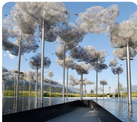
Swarovski Crystal Worlds 'Kristallwelten'