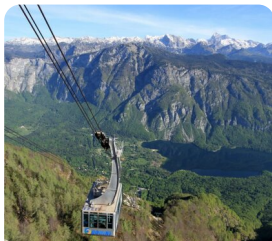
Lake Bohinj Vogel Cable Car Ride