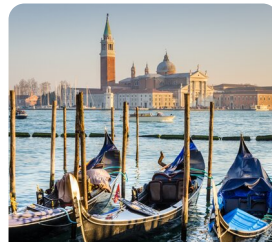
Venice Walking Tour & visit Doges Palace