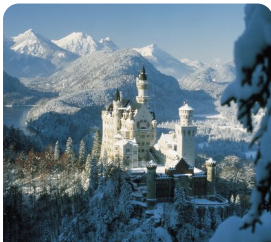
Neuschwanstein Castle Fairytale Castle of 'Mad' King Ludwig

These are just a few of the very special hand selected experiences that will really make your touring experience exceptional and unique, and don't forget, with Albatross they are always included.