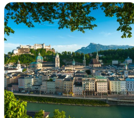
Salzburg Guided Walking Tour