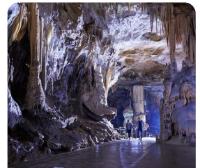
Postojna Caves Mesmerising Cave Adventure