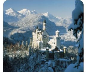
Neuschwanstein Castle Fairytale Castle of 'Mad' King Ludwig