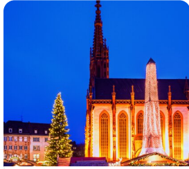
Würzburg Christmas Markets

These are just a few of the very special hand selected experiences that will really make your touring experience exceptional and unique, and don't forget, with Albatross they are always included.