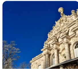
Linderhof Palace Guided Tour