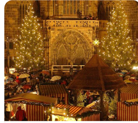
Nürnberg Christmas Markets