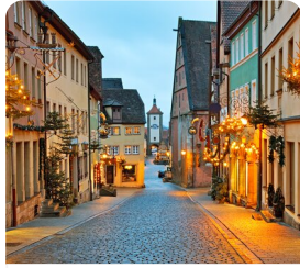
Rothenburg Night Watchman Walking Tour