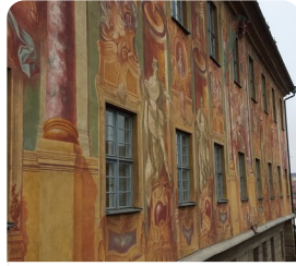
Bamberg UNESCO World Heritage Site