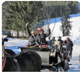
Horse and Carriage Ride Through the Local Countryside