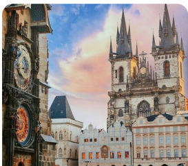
Prague Visit Prague Castle