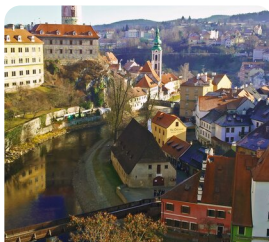
Český Krumlov Guided Tour