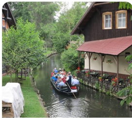
Lübbenau Punt Ride on the Spreewald