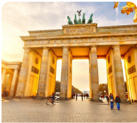
Berlin Guided Panoramic Tour

These are just a few of the very special hand selected inclusions that will really make your touring experience exceptional and unique, and don't forget, with Albatross they are always included.