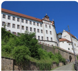
Colditz Castle Guided tour of the Infamous 'Escape Castle'