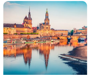
River Elbe Boat Cruise Pillnitz to Dresden