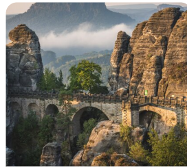
Saxon Switzerland Visit the Pristine National Park