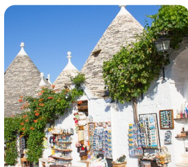
Alberobello Trulli "Bee-Hive" Houses

These are just a few of the very special hand selected experiences that will really make your touring experience exceptional and unique, and don't forget, with Albatross they are always included.