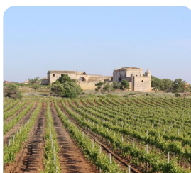
Baglio Oneto Wine Tasting