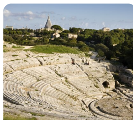
Syracuse & Ortigia Ancient Ruins & a Historical Centre