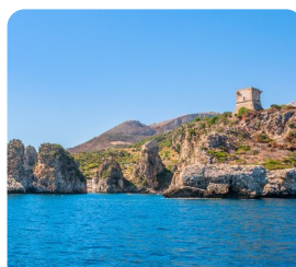
Zingaro Nature Reserve Coastal Boat Cruise