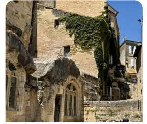
Saint-Émilion Underground Monolithic Church