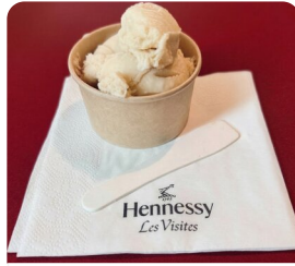
Château Cognac Royale Sip Cognac in Cognac!