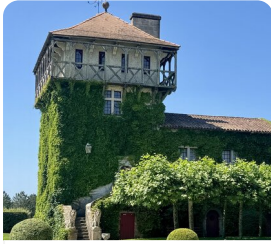
Bordeaux Vineyard Lunch Classic Bordeaux Chateau wines along with lunch

These are just a few of the very special hand selected inclusions that will really make your touring experience exceptional and unique, and don't forget, with Albatross they are always included.