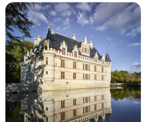
Loire Valley Châteaux 4 very special visits