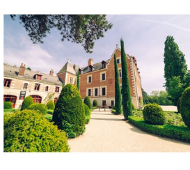
Amboise Da Vinci's Residence