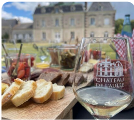
Château picnic lunch A picnic in the Loire vineyards under a shady tree