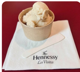
Château Cognac Royale Sip Cognac in Cognac!