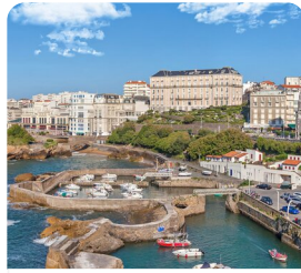
Dune de Pilat Bay of Biscay and the Atlantic Coast.