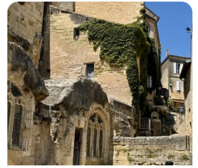
Saint-Émilion Underground Monolithic Church