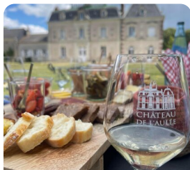
Château picnic lunch A picnic in the Loire vineyards under a shady tree