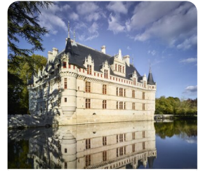
Loire Valley Châteaux 4 very special visits