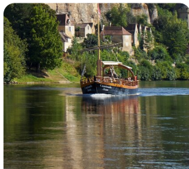
Dordogne over 4 nights So many special visits...