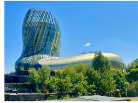
Cité du Vin The World of Wine