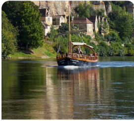
Dordogne over 4 nights So many special visits...