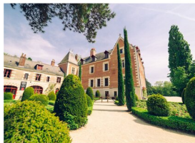
Amboise Da Vinci's Residence