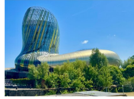
Cité du Vin The World of Wine