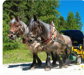
St Moritz Horse & Carriage Ride