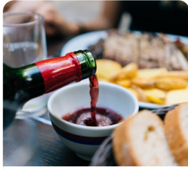
Lugano Food & Wine tasting