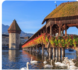
Luzern Lake Cruise and Funicular Train to Bürgenstock