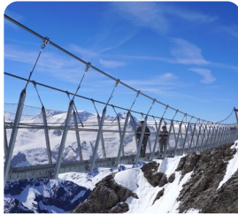
Mt Titlis Cable car ride