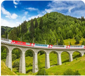
Ride the Glacier Express Panoramic Train