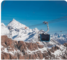
Glacier Matterhorn Paradise Stunning Cable Car Ride