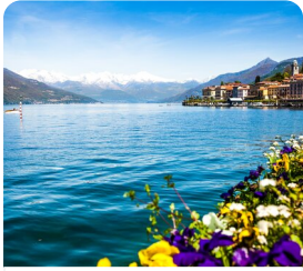
Bellagio on Lake Como Private Boat Cruise

These are just a few of the very special hand selected experiences that will really make your touring experience exceptional and unique, and don't forget, with Albatross they are always included.