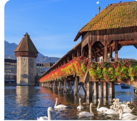
Luzern Lake Cruise and Funicular Train to Bürgenstock