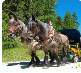
St Moritz Horse & Carriage Ride