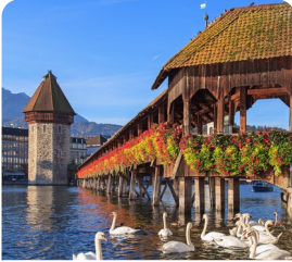
Luzern Lake Cruise and Funicular Train to Bürgenstock

Correct as of 04:25 on 15th January 2026