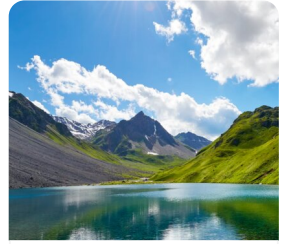
Arosa Alpine Village Mountain lunch and Bear sanctuary