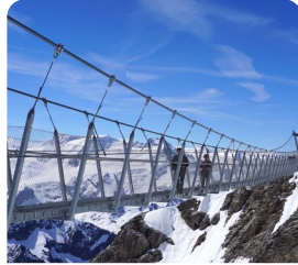
Mt Titlis Cable car ride