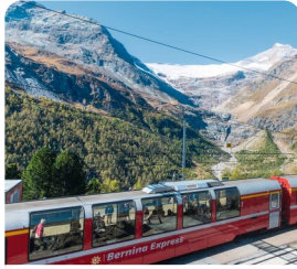
Bernina Express Train to St Moritz