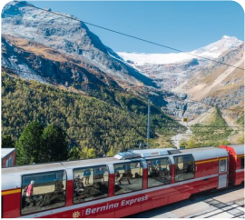
Bernina Express Train to St Moritz