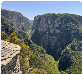
Vikos Gorge Stunning Vikos Canyon – 'the Grand Canyon of Greece'