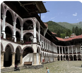
Rila UNESCO Heritage listed Orthodox Monastery

These are just a few of the very special hand selected experiences that will really make your touring experience exceptional and unique, and don't forget, with Albatross they are always included.