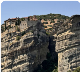
Meteora Suspended in the air - UNESCO Meteora Monasteries