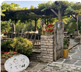
Megalo Papingo Drive the 'Snake Road' to enjoy dinner on the vine covered terrace of a village Taverna