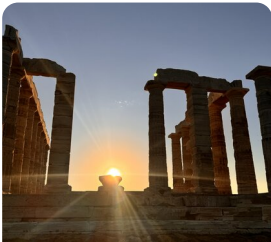
Cape Sounion Temple of Poseidon Sunset

Correct as of 04:23 on 15th January 2026