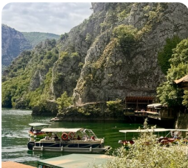
Matka Canyon & Vrelo Caves Canyon cruise & Cave visit