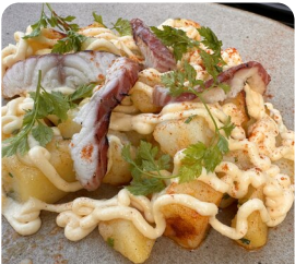
Corfu Sample and taste typical 'Corfiot' local products