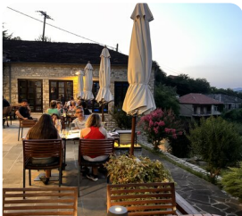
Aristi Mountain Resort Enjoy a fabulous 3 night stay in the multi award winning Aristi Mountain Resort and Villas.