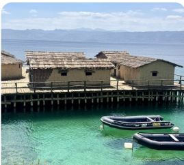
Bay of Bones Visit the UNESCO listed 'Bay of Bones' Museum