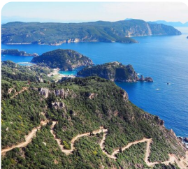
Corfu Mountains A 4WD mountain adventure