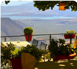
Delphi Dinner with a view