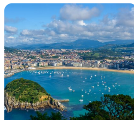
San Sebastian Guided Walking Tour