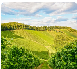
Rioja Wine region Scenic Drive & Wine Tasting

These are just a few of the very special hand selected inclusions that will really make your touring experience exceptional and unique, and don't forget, with Albatross they are always included.