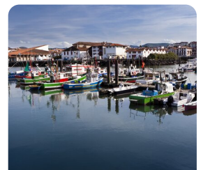
Saint Jean-de-Luz Delightful Seaside Town