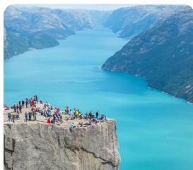
Stavanger Lysefjord Cruise for Pulpit Rock

These are just a few of the very special hand selected inclusions that will really make your touring experience exceptional and unique, and don't forget, with Albatross they are always included.