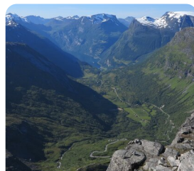
Dalsnibba Pass Visit the incredible Geiranger Skywalk