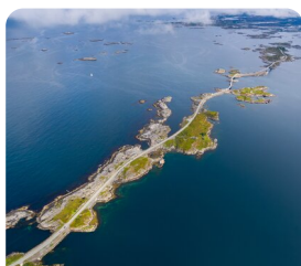
Atlantic Ocean Road 'The Most Beautiful Coastal Drive in the World'