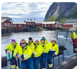
Lofoten Islands RIB Boat Excursion