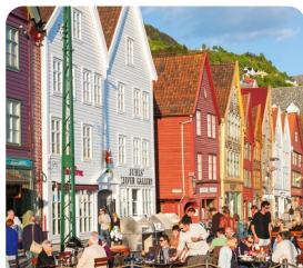
Bergen Bryggen & Fløibanen Funicular