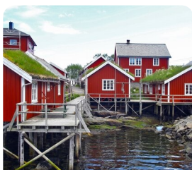
Lofoten Archipelago Stay in Historic Fisherman's Cabins