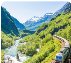
Flam Railway World Famous, Scenic Train Ride