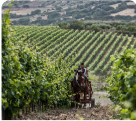
Olianas Winery Vineyard Tour, Tasting & Light Lunch

These are just a few of the very special hand selected inclusions that will really make your touring experience exceptional and unique, and don't forget, with Albatross they are always included.