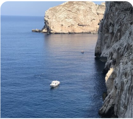
Alghero Visit Neptune's Caves