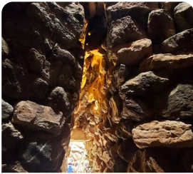
Su Nuraxi UNESCO World Heritage Listed Nuraghe rock town.