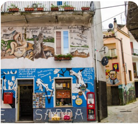
Orgosolo The Village of Murals