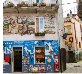
Orgosolo The Village of Murals