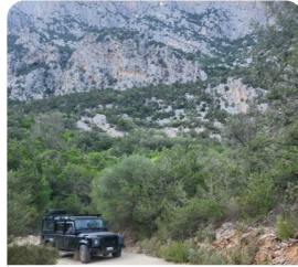
Supramonte Mountains 4WD Excursion & Shepherd's Picnic Lunch