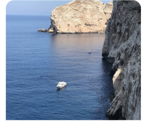
Alghero Visit Neptune's Caves