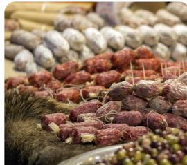
Calvi Local Wine & Produce Tasting