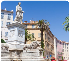
Ajaccio Napoleon's Birthplace