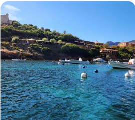
Scandola Nature Reserve Coastal Boat Cruise & Lunch in Girolata

Correct as of 23:16 on 14th January 2026