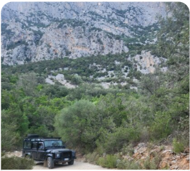
Supramonte Mountains 4WD Excursion & Shepherd's Picnic Lunch