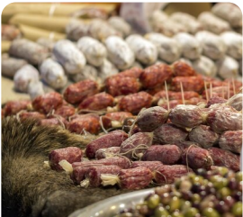
Calvi Local Wine & Produce Tasting