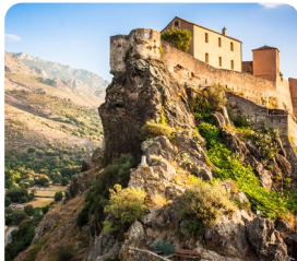
Corte Scenic Train Ride