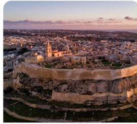
Island of Gozo Victoria Citadel and Xlendi