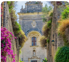
Lipari Guided Walking Tour

These are just a few of the very special hand selected experiences that will really make your touring experience exceptional and unique, and don't forget, with Albatross they are always included.