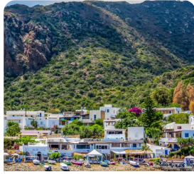
Panarea and Stromboli Afternoon Cruise & Evening 'Stromboli Fireworks'