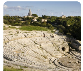
Syracuse & Ortigia Ancient Ruins & a Historical Centre