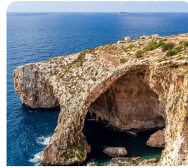
Ħaġar Qim & The Blue Grotto Ancient Temples & a Boat Cruise