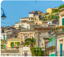
Modica Cioccolato di Modica