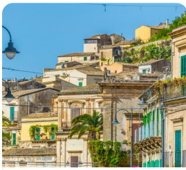
Modica Cioccolato di Modica