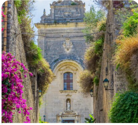
Lipari Guided Walking Tour

These are just a few of the very special hand selected inclusions that will really make your touring experience exceptional and unique, and don't forget, with Albatross they are always included.