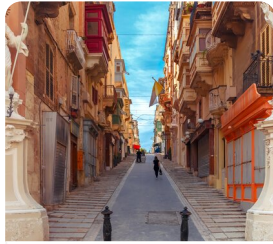
Valletta Guided walking tour and visit The Malta Experience