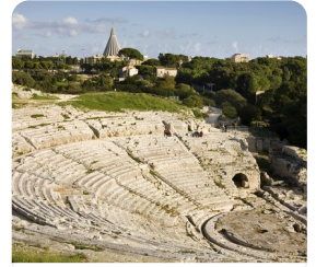
Syracuse & Ortigia Ancient Ruins & a Historical Centre