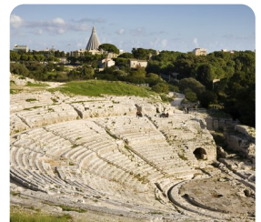
Syracuse & Ortigia Ancient Ruins & a Historical Centre