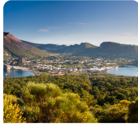
Vulcano Panoramic Drive