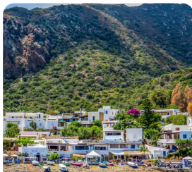
Panarea and Stromboli Afternoon Cruise & Evening 'Stromboli Fireworks'