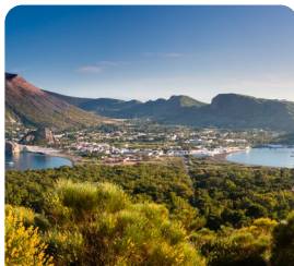
Vulcano Panoramic Drive