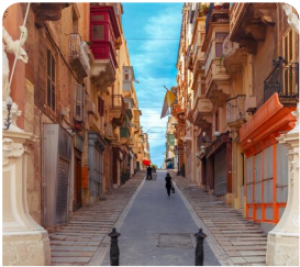
Valletta Guided walking tour and visit The Malta Experience