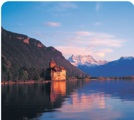
Chateau Chillon Guided Tour