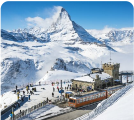
Zermatt Ride the Gornergrat Cog Railway