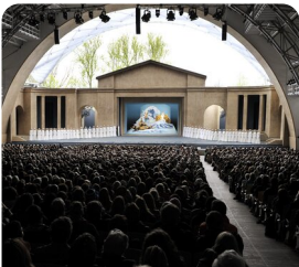
Oberammergau Passion Play Theatre Guided Tour

Correct as of 04:25 on 15th January 2026