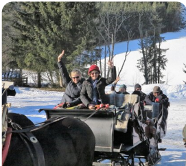
Horse and Carriage Ride Through the Local Countryside