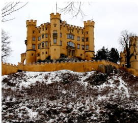
Hohenschwangau Castle Guided Tour