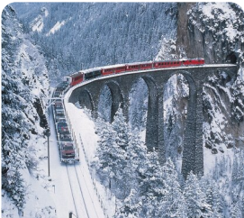
Glacier Express Panoramic Train