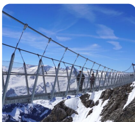
Mt Titlis Cable car ride