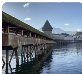
Luzern Walking Tour