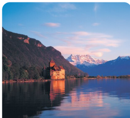
Chateau Chillon Guided Tour