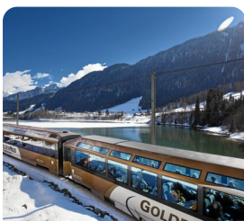
GoldenPass Express Panoramic Train Journey