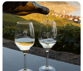
Lavaux Wine Road Vinorama