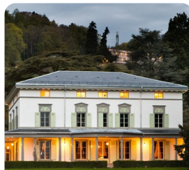
Charlie Chaplin's House Chaplin World