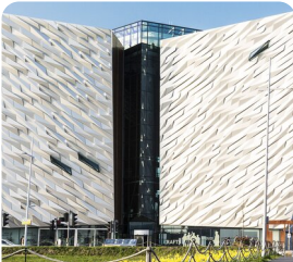
Belfast The Titanic Experience

Correct as of 04:23 on 15th January 2026