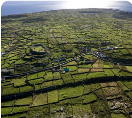
Aran Islands 'Wild Atlantic Bus' Island Tour & Lunch