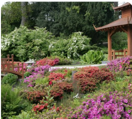
Wicklow Mountains Powerscourt Gardens & Glendalough

These are just a few of the very special hand selected experiences that will really make your touring experience exceptional and unique, and don't forget, with Albatross they are always included.