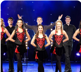
Trad on the Prom Irish Dance and Music Show