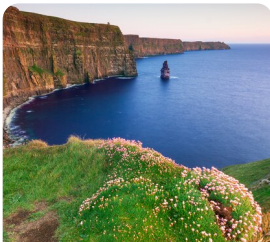
Cliffs of Moher Spectacular Views