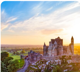
Kilkenny Irish Pub Lunch, Clonoulty & the Rock of Cashel