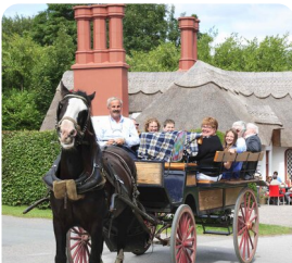
Killarney Lough Léin Cruise & Jaunting Cars