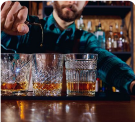
Bushmills Distillery Whiskey Tour & Tasting