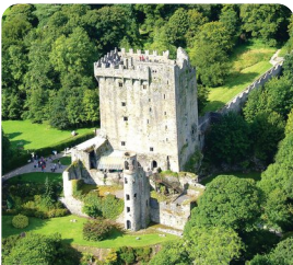
Cork Blarney Castle, Woollen Mills & Cobh Heritage Centre