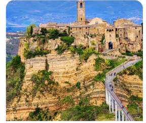
Civita di Bagnoregio A Mysterious Hilltop Town