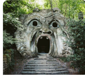
Sacro Bosco Park of the Monsters