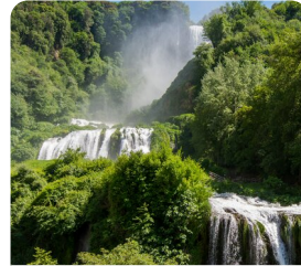
Waterfalls of Marmore Europe's highest man-made waterfalls