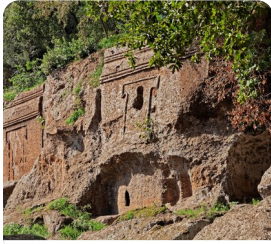
Tarquinia Guided tour of an Etruscan Necropolis

These are just a few of the very special hand selected inclusions that will really make your touring experience exceptional and unique, and don't forget, with Albatross they are always included.