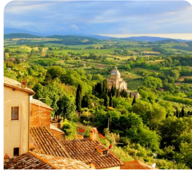
Val d'Orcia Explore Montepulciano & Pienza