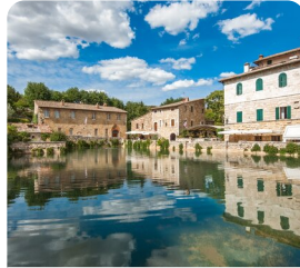
Bagno Vignoni Unique Hot Springs