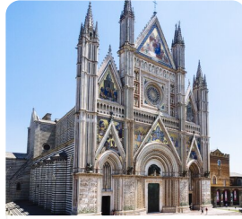
Orvieto Guided Walking Tour